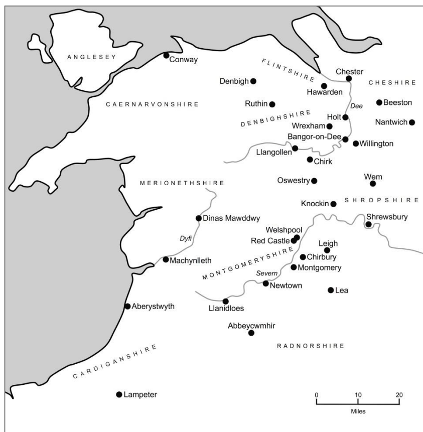
Plate 1: The region of Thomas Myddelton's 1644–45 campaign. (© Jonathan Worton)

Conquest of Powys, 1644–45' published in Montgomeryshire Collections in the early 1960s and providing a thorough view of Myddelton's campaign for the first time. 4 This article is not intended to correct or significantly revise Dore's scholarly account, but rather to complement and expand on it.