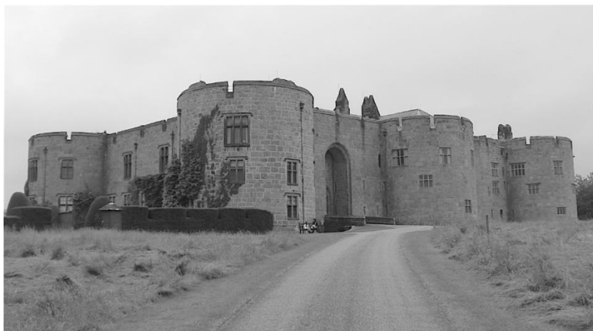
Plate 2: Sir Thomas Myddelton's family seat at Chirk Castle, seized by Royalists in January 1643 and unsuccessfully besieged by Myddelton's Parliamentarians at Christmas 1644.